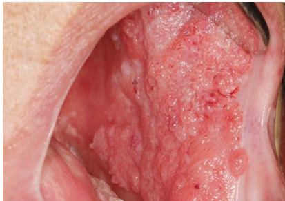
Figure 5: Extensive Papillary OSCC of the cheek with a cobblestone appearance. This lesion had been present for a while and could have been diagnosed earlier. Notice the abnormal growth and the danger sign of bleeding.