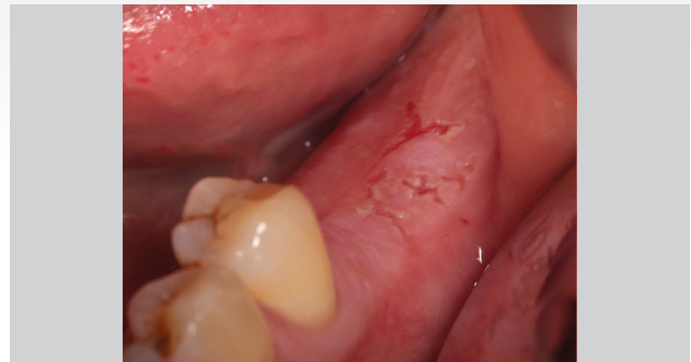
Figure 8: White lesion with small ulcerative areas. The patient reported a burn with hot food a few days prior to examination. This lesion must be followed up for at least 2-3 weeks to see if it heals.

the tongue completely and gently pull the tongue out and sideways. Make sure the lateral sides of tongue are visually inspected from the posterior foliate papillae to the tip of the tongue. A dental mirror is used to push the tongue away from the teeth to allow visual inspection of the entire floor of the mouth, from its posterior to its anterior aspect. Once the tongue is released, push the tip of the tongue posteriorly to enable visual inspection of the anterior floor of the mouth. This is the highest risk areas for OSCC and should be examined thoroughly at every opportunity. 3