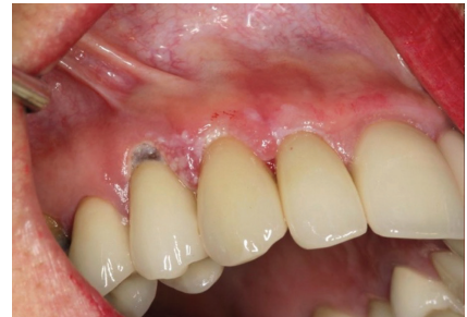
Figure 6: Although this gingival carcinoma may have a small footprint, its treatment will involve extensive resection and loss of teeth. This is often misdiagnosed as either periodontal infection or a candidal infection.

or erythroplakia (red lesions) (Fig 2). Clinical erythroplakia lesions have a high probability of being OSCC histologically and a recent systematic review shows that 42.8% of oral erythroplakias are already a carcinoma at the time of the first biopsy. 4