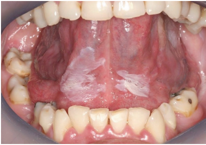
Figure 1: White lesions of the ventral aspect of the tongue and floor of mouth must be examined histologically. It is a high-risk area for OSCC.