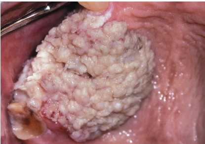
Figure 4: Wart-like (verrucous) carcinoma of the palatal area with a pronounced white surface.