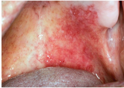
Figure 2: Red lesions on the palate may be easy to identify, but red lesions on floor of the mouth or posterior region of the soft palate are more difficult to discover. The lesion depicted in this photograph was diagnosed histologically as OSCC.