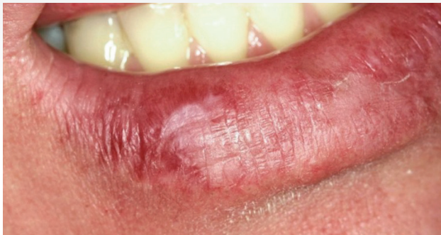
Figure 7: Early lip carcinoma appearing as a white/red crusted area. An astute dental practitioner should always examine the lip as part of a comprehensive oral examination.