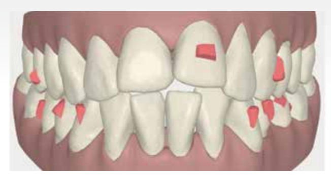
Figure 10: Initial centre view using Clincheck software.