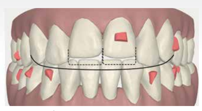
Figure 11: Final centre view.