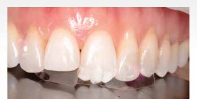
Figure 6: SDI Aura is applied onto the tooth to check the shade of the composite against the tooth after whitening. A test composite is placed onto the tooth at the very beginning of the bonding procedure prior to isolation so that the correct shade of composite is selected before the tooth dehydrates to a lighter shade. The translucent enamel shades are tested first. Here Aura E1 and E2 are being tested onto the transluscent incisal tip