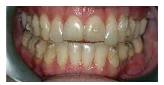
Figure 3: Patient commenced upper and lower Invisalign treatment with orthodontist Dr Katz to improve the positioning of the teeth.