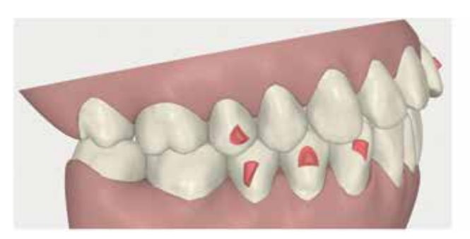
Figure 12: Initial right buccal view.