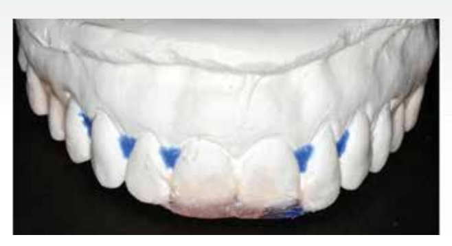
Figure 5: Study models used to make the retainer after Invisalign treatment was completed. The aligner had to be fitted immediately after treatment started and before undertaking the restorative bonding to lengthen the upper right anterior. The technician made a stent so we knew how much length we needed to add.