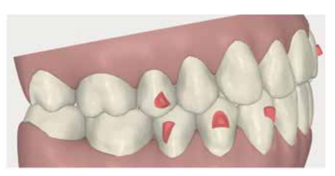
Figure 13: Final right buccal view.

to wait for a period of two weeks to allow all the oxygen to be dissipated from the tooth and for the shade to settle to the actual shade.