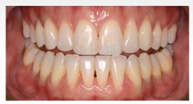
Figure 2: The results after Invisalign, whitening and restorative bondings.