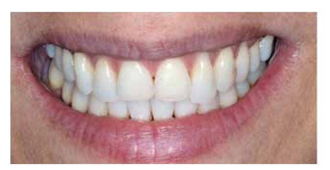
Figure 4: While wearing the Invisalign aligners, the patient bleached with 10% carbmide peroxide to improve the shade of her teeth. This photo illustrates the whitening gel has started to work and starts on the incisal edges first and moved up to the neck of the tooth.