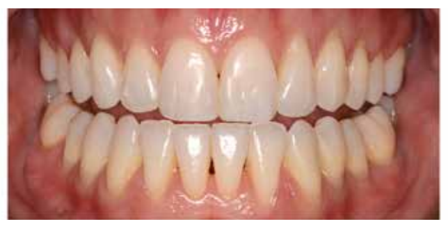
Figure 8: The results after Invisalign, whitening and restorative bondings with SDI Aura on the upper right and left centrals. The composite is shaped and polished with discs, rubber wheels and then final polish with felt wheels and SDI polishing paste for the enamel lustre. As the Aura has the enamel as a microfill it can be polished to a high gloss afterwards. The dentine layer is a nanohybrid.

home whitening treatment (Figures 1 and 2).