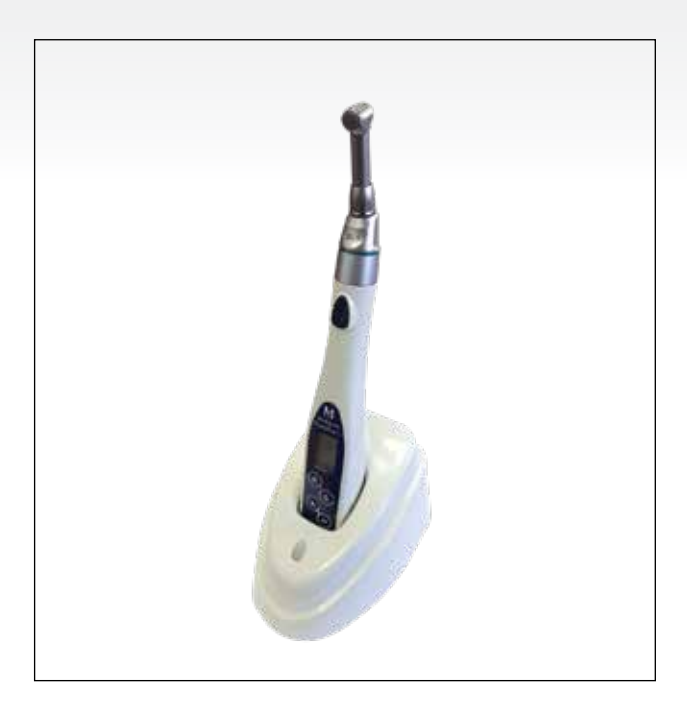
Figure 1: Root Pro CL (Medidenta) Endodontic Motor

motion.<sup>5,11</sup> Also, when an instrument is used in reciprocating motion with unequal forward and reverse angles and with limited in-and-out movements, it is less prone to bind to the canal walls.<sup>12</sup>