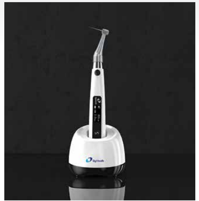
Figure 2: E-Connects (Eighteenth Medical) Endodontic Motor

Moreover, reciprocation canal preparation time with only one F2 PTU file (Dentsply Sirona) was shown to be less than the same file system used in full rotation.<sup>5</sup> Similar studies noted that only one file was needed to reach full working length in half the preparation time in comparison to the continuous rotation sequence. Faster canal preparation has