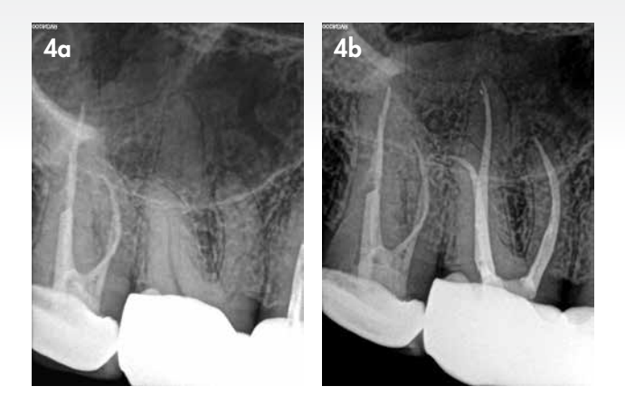
Figure 4(a) Pre-operative periapical radiograph of maxillary right first molar that presented with irreversible pulpitis; (b) Postoperative periapical radiograph showing the result after obturation depicts the final result after obturation. Note the sharp apical curvature in the distal root canal system that was maintained.

in the distal root canal system that was maintained using the X2 PTN file in reciprocation motion.