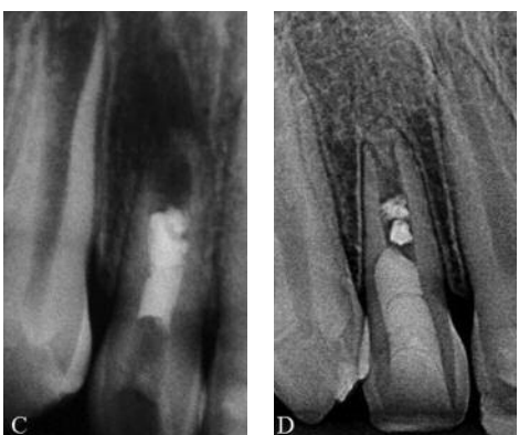
Figure 1c: Five-month follow-up.