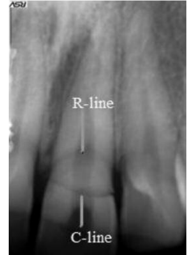
Figure 3: X-ray of tooth 21 with the typical progression.