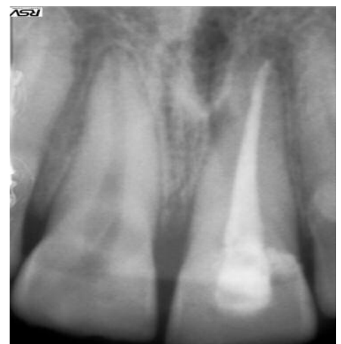
Figure 5: Definitive endodontic treatment of tooth 21.