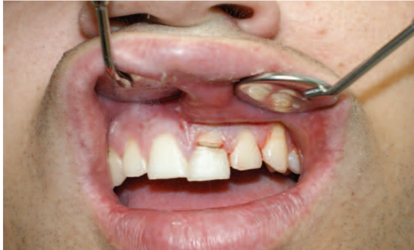
Figure 2: Crown-root fracture: The coronal opening communicates directly with the pulp.