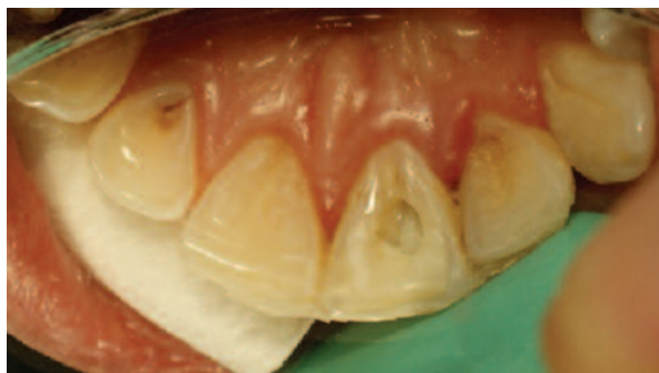
Figure 7: The inserted endodontic post Rebilda Post (palatal view).