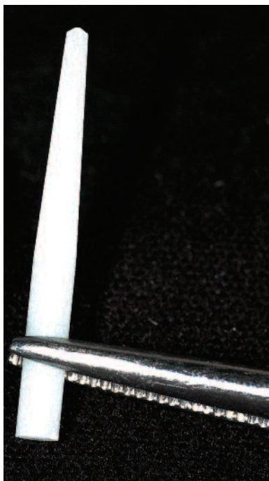
Figure 6: Rebilda Post (VOCO).