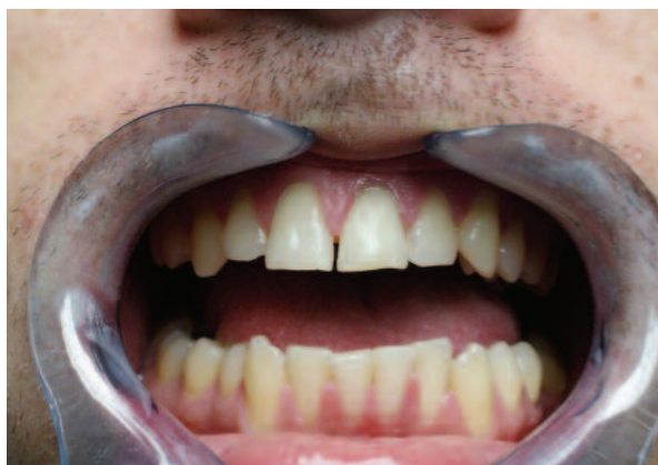
Figure 8: Tooth 21 after treatment.

The Ebelseder (Ebelseder et al., 1993) method of internal splinting was carried out to secure the refixation result, whereby the two fragments were connected with a glass fibre-reinforced composite endodontic post (Rebilda Post, VOCO, Figure 6).