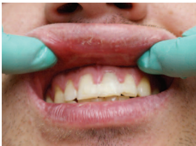
Figure 4: Splinting of the fragments that support the crowns using glass fibre strips and composite.

Trepanation and pulp extirpation were carried out after the splinting. A definitive endodontic treatment was not possible during the first treatment, because the root canal bled heavily. Calcium hydroxide was thus applied as a temporary filling. The root canal was then definitively treated in the second appointment (Figure 5).