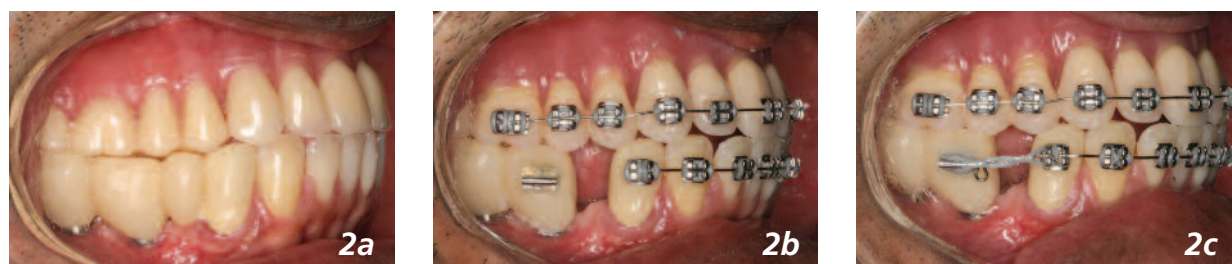
Figure 2a: Lateral view of the arch prior to attaching the orthodontic appliance; 2b – bonded tube; 2c – tube supporting orthodontic arch and elastic force of 180 gf.