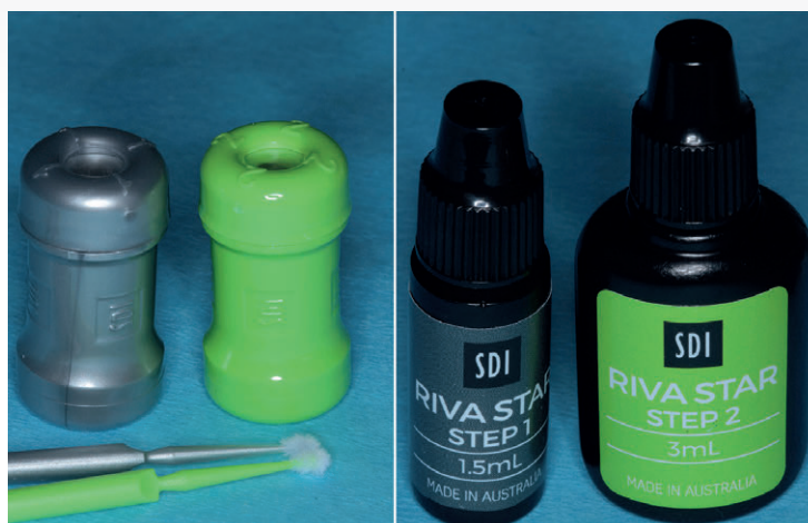
Figure 1. RIVA STAR (SDF) delivery systems.

The following step-by-step stages have been recommended for treatment of carious lesions 1,2,3 and key clinical stages are simulated on an extracted tooth (Figure 2A)