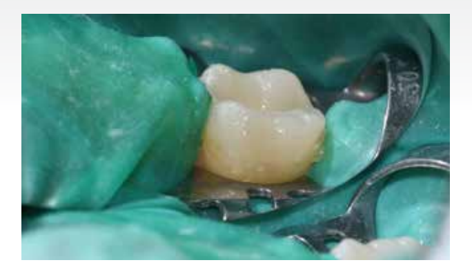
Figure 13: Filled cavity with x-tra fil before preparation.