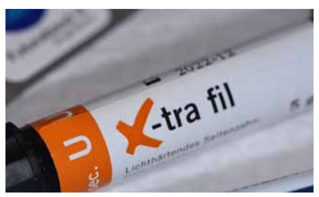
Figure 10: The light-curing posterior bulk-fill material (4mm) x-tra fil.