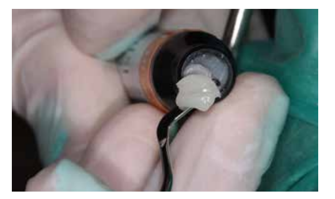
Figure 9: Taking the light-curing material for the posterior bulk filling (4mm) off the rotary syringe.