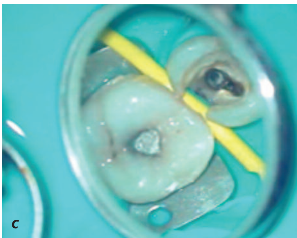
Figure 1c: Perforation site was repaired with light-cured glass ionomer.