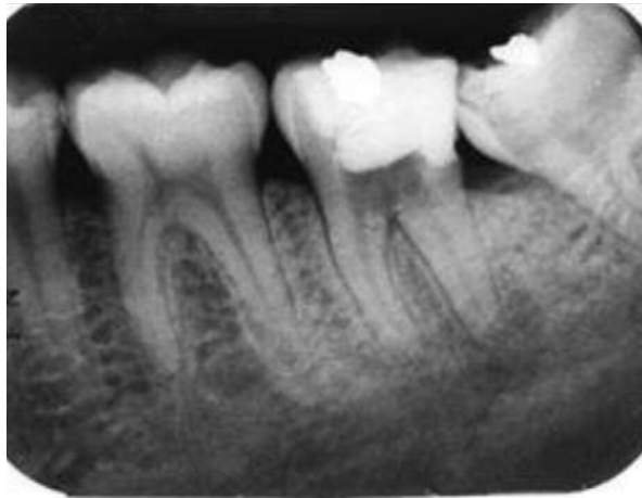
Figure 2a: Tooth 37 showing periapical radiolucency with furcal perforation.