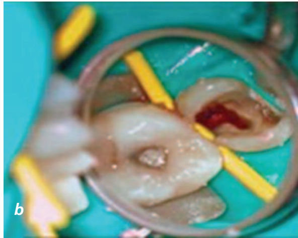
Figure 1b: Bleeding from the perforation site.