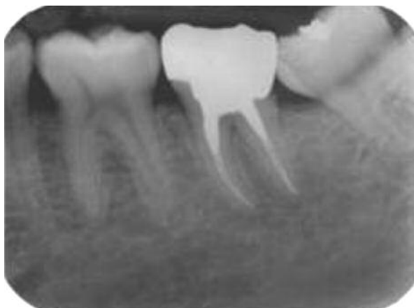
Figure 2c: Two years periapical radiograph revealed complete bone formation at the apex and furcation.

report one. Upon establishing access and removal of all existing restorative material and caries, a round perforation defect measuring about 2mm in diameter was detected on the pulpal floor towards the lingual aspect of the tooth (Figure 2b). Unlike the previous case, the perforation showed minor hemorrhaging and had no caries. One percent NaOCl irrigation followed by pressure packing with sterile gauze as described in case report one was used to achieve hemostasis. After rinsing with distilled water and drying, the perforation site was etched with a dentin conditioner (GC Corporation, Tokyo, Japan), which was applied to the surrounding dentin for 10 seconds, followed by rinsing with distilled water for five seconds and light air drying. Subsequently, the perforation site was repaired with a