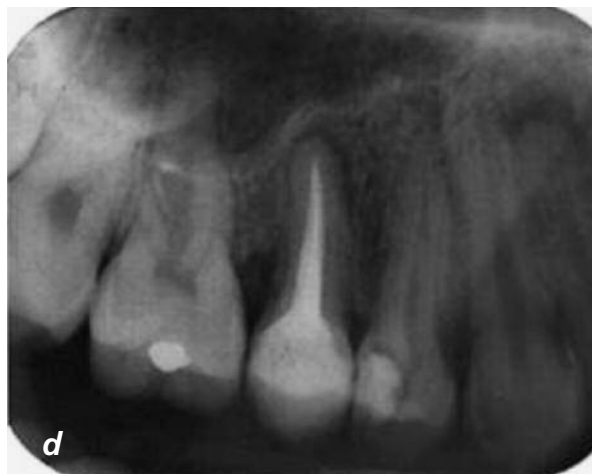
Figure 1d: One year post perforation repair and eight months post canal obturation showing signs of healing and intact repaired site.