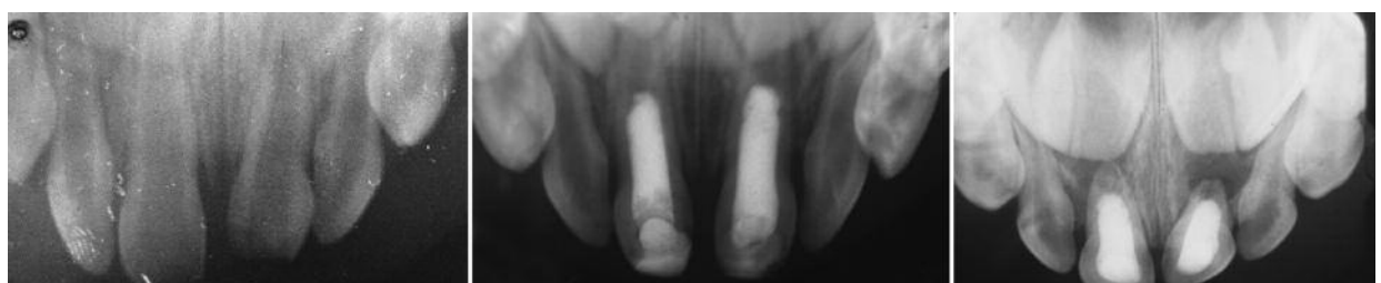
Figure 4: Intrusion of 61 in an 18 months old child. Preoperative, one-year and 4-years follow-up radiographs.

Pulpectomy is indicated in case of acute pulp inflammation leading to an uncontrollable hemorrhage after pulpotomy, in case of trauma on anterior primary or permanent teeth involving the pulp tissue, and in cases of necrosis and/or periodontal lesions 32 (Figures 3-4).