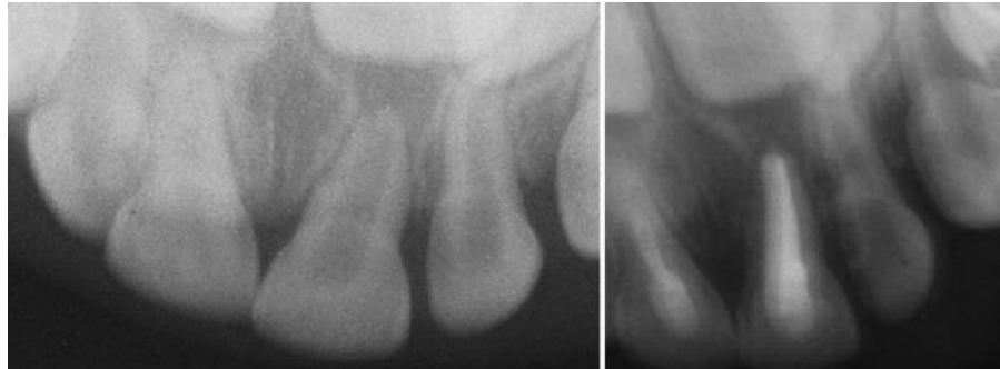
Figure 3: Extrusion of tooth #61 and follow-up root canal therapy treatment in an 18 months old child.

can later evolve into a cystic lesion is possible 31 , hence the necessity of follow-up sessions and control x-rays at 1,3,6 months then 1 year.