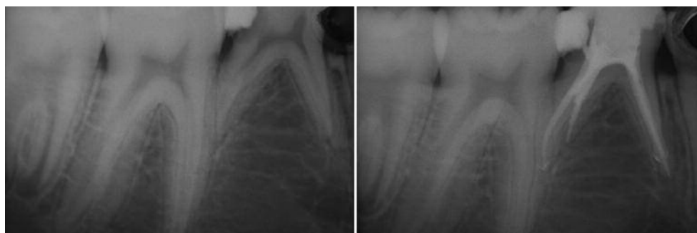
Figure 5: This is the case of agenesis of the lower right second premolar. Lower right second primary molar had conventional root canal therapy performed with gutta-percha obturation.