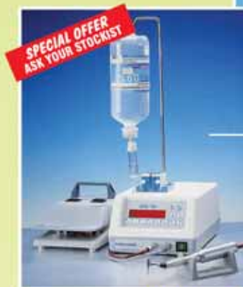
MD 10 Micro motor system with brushless motor

for Implantology, Maxillo-Facial and dental surgery.