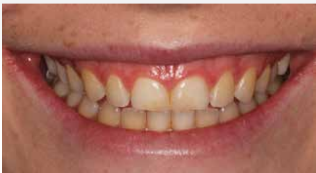
Figure 1: Gummy smile due to Altered Passive Eruption.