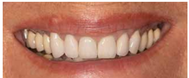
Figure 17: 25 Years after surgery, showing stable gingival margins.

in this case, but also to prevent inadequate papillae fill in the gingival embrasure spaces after healing (Figure 11). Vertical everting mattress 6/0 braided sutures were used to close the flap with maximum embrasure filling with soft tissue (Figure 12). Although monofilament sutures such as nylon have less bacterial contamination potential, softer braided sutures are much more comfortable to the patient. Healing was uneventful and some lengthening was obtained with the recession that took place after osteotomy (Figure 13).