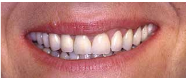
Figure 16: Six months after placing final crowns.