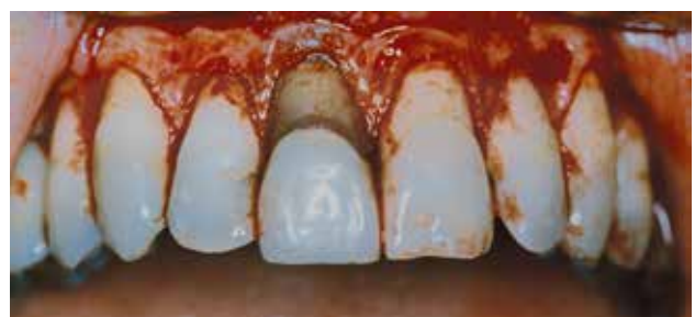
Figure 11: Full flap reflection with partial thickness interdentally, allowing access to buccal and interdental bone for ostectomy and osteoplasty.