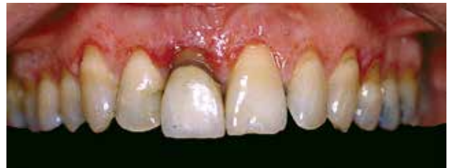
Figure 15: Two weeks after second stage surgery, showing the extent of lengthening.