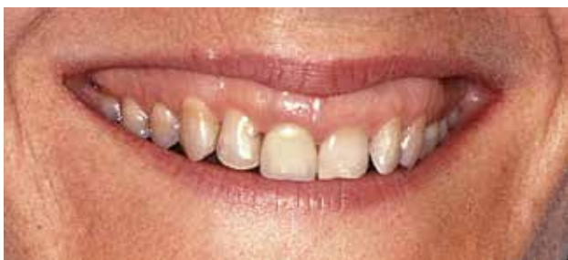
Figure 8: Altered passive eruption with a component of vertical maxillary excess, showing incomplete exposure of clinical crowns.

Following administration of local anaesthesia, the ostectomy and osteoplasty was performed after elevating a full thickness buccal flap with no palatal flap elevation (Figure 11). The surgical guide served as a reference for the planned crown margins, to ensure adequate amount of ostectomy and to prevent future violation of the space to be occupied by the supra-crestal attached tissues. Deep interdental split thickness flap design allowed full access to the interdental bone for contouring. No interdental crestal reduction was done, mainly because it was not indicated