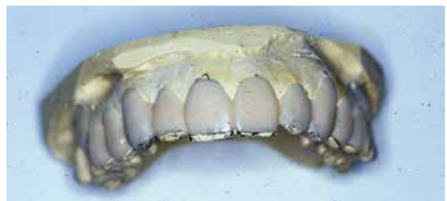
Figure 9: Surgical stent to indicate the new planned clinical crowns.