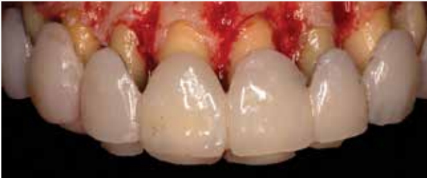
Figure 5: Surgical stent used to assess ostectomy levels.