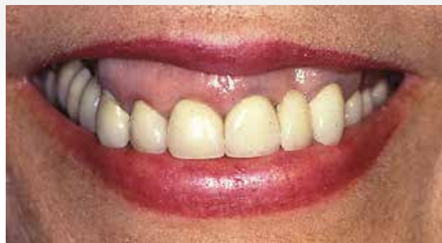
Figure 2: Asymmetric gingival contour.

It is important to be able to diagnose the underlying problem correctly before embarking on the procedure.