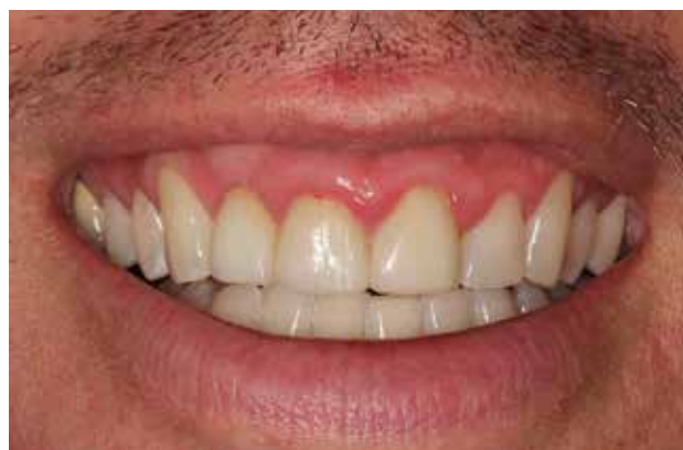
Figure 3: A gummy smile due to vertical maxillary excess where teeth are almost fully exposed.

APE can be classified into two types, based on the position of the mucogingival junction in relation to the cemento-enamel junction. 9 Type 1 APE is characterised by the mucogingival junction being apical to the alveolar bone crest, usually with a wide band of attached gingiva. 6 This band of attached gingiva is usually wider than the generally