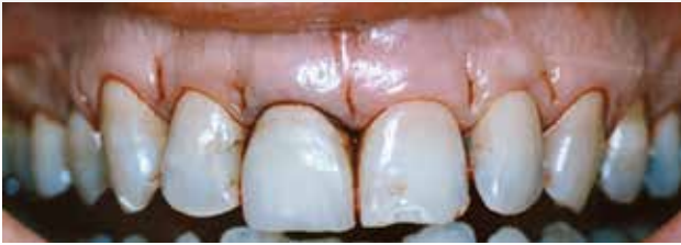
Figure 12: Closure of flap with vertical everting mattress sutures to allow for maximum soft tissue fill in embrasure spaces.