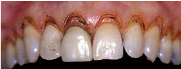
Figure 14: Second stage gingivectomy after 4 months.