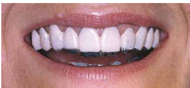
Figure 10: Surgical stent placed intra-orally with incisal edges blocked out using a black pencil.