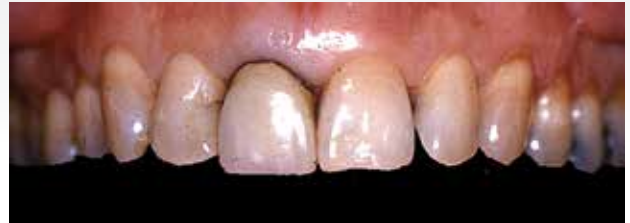
Figure 13: Healing after 3 months showing 2-3mm of recession in a symmetrical pattern, following the bone contour.