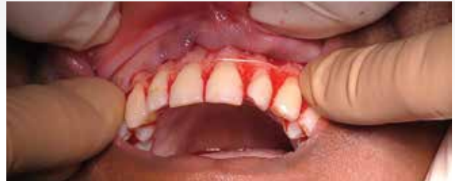
Figure 6: Floss can be cold sterilized and used intra-operative to assess symmetry in bone levels.