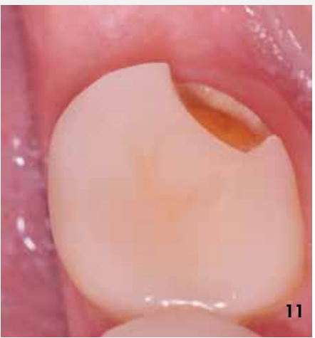
Figure 10: Grade 3 chipping of an IPS Empress II anterior crown after 16 years. The restoration was repaired by adhesively bonding the fragment in place again. Figure 11: Classical fracture of a molar crown (in this case Celay silicate ceramic, Vita Zahnfabrik) after 14 years. The crown was completely removed and a new restoration was placed after minimal preparation.

450 restorations (Table 1 – QR code). Nine of the patients suffered from some form of Al. The patients were observed over a period of maximum 17 years. During this time, the following complications occurred in 44 restorations (10 %) in 11 patients (65 %):