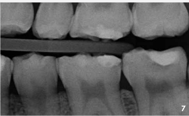
Figures 6 & 7: The entire crown of tooth 23 is missing (Fig. 6). The bitewing radiograph (Fig. 7) shows normally formed dentin: parts of it are bare, while other parts are covered with only a thin layer of enamel.