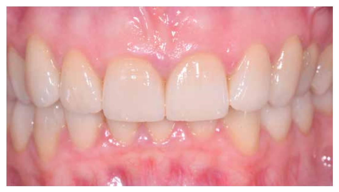
Figure 12: Photo of the restorations placed in the patient shown in Figure 2 after five years of service.

• Thirty-three of the "relative failures" were caused by chipping (25). It is interesting to note that 11 of the "chipoffs" were recorded in one patient alone. Despite the observed complications, the success rate was 95.7% after three years and 81.4% after ten years. A statistically relevant difference was noted between patients with and without Al. The success rate of patients with Al was significantly higher.