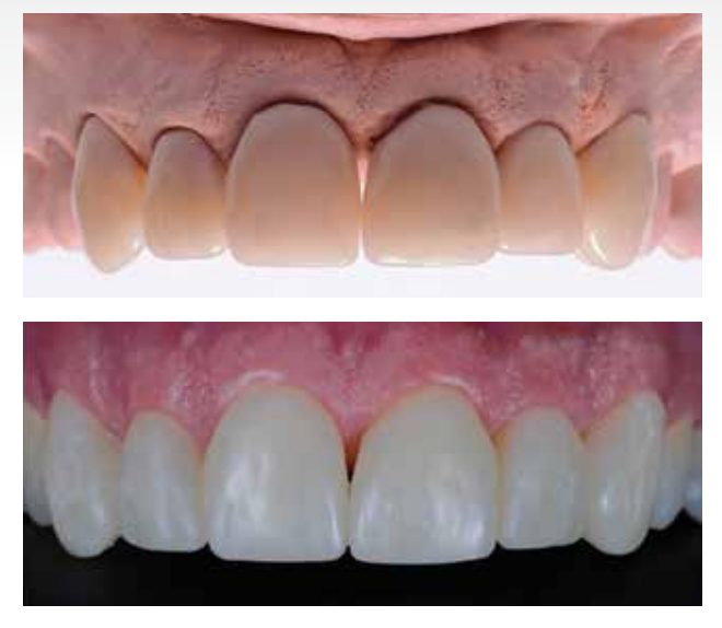
Figure 11: The restoration on the model and in its final position in the mouth.

The patient was instructed in the essential care and monitoring of the restoration before being discharged with the first follow-up appointment scheduled for 48 hours later. After two follow-up sessions in which the marginal integrity, possible excess material, occlusal contact points and oral hygiene were assessed without any complaints, the patient was briefed on the importance of maintaining good oral hygiene and the requirement for a check-up every six months and then permanently discharged (Fig. 11).