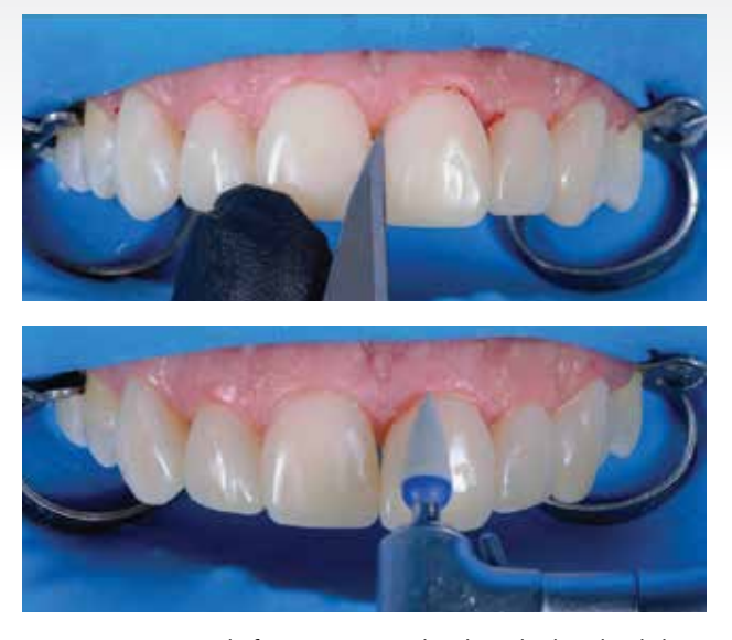
Figure 10: Removal of excess material with scalpel and polishing with the Diamanto polishers.

veneers brought into their final position and a check for excess material performed. Following removal of the excess material with a brush, the material was light-cured for five seconds to stabilise the veneers. With the restorations fixed in this way, the next step was to remove the excess material using dental floss on the proximal surface and a no. 11 scalpel on the cervical surface (Fig. 9).