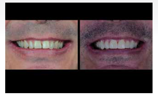
Figure 2: Close-up of smile before and after treatment.