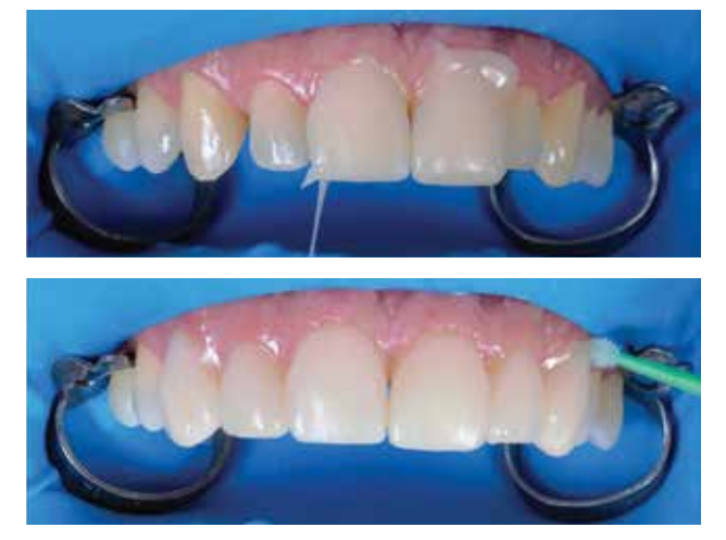
Figure 9: Removal of excess Bifix luting material.