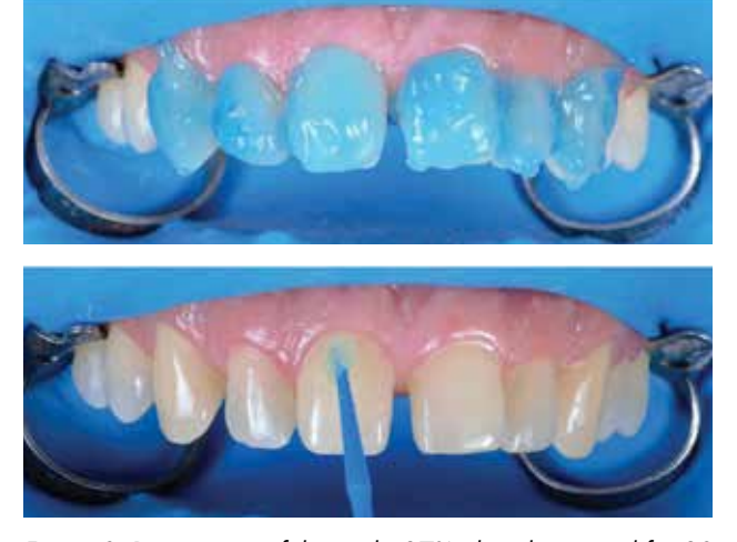
Figure 8: Preparation of the teeth: 37% phosphoric acid for 30 seconds, apply Futurabond U and massage in for 20 seconds.

Following the preparation of the veneers and the teeth, the next step was the final insertion of the composite. The dual-curing composite-based luting system Bifix QM (VOCO GmbH) was applied to the interior side of the veneers, the