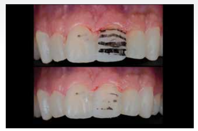
Figure 4: Mock-up.