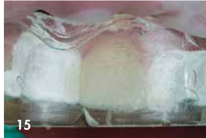
Figure 15: Due to the high transparency of the key, it can be visually checked if a sufficient amount of composite has been injected to cover the entire surface. The composite can also be easily light-cured through the key.