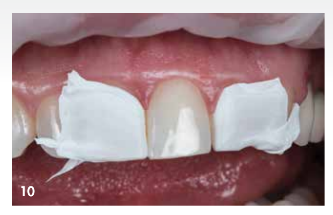
Figure 10: Neighbouring teeth 11 and 22 were isolated using Teflon tape.