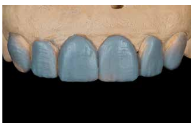
Figure 3: A wax-up was made in consultation with the patient.

Next, the silicone key was positioned onto the teeth and the composite was injected (Fig. 14). G-ænial Universal Injectable (GC), shade A1 was selected for the procedure because of its high filler load and wear-resistance. The syringe was placed in the hole and slightly orientated towards vestibular. During the injection, a little bit of overflow is needed to ensure that all small voids at the