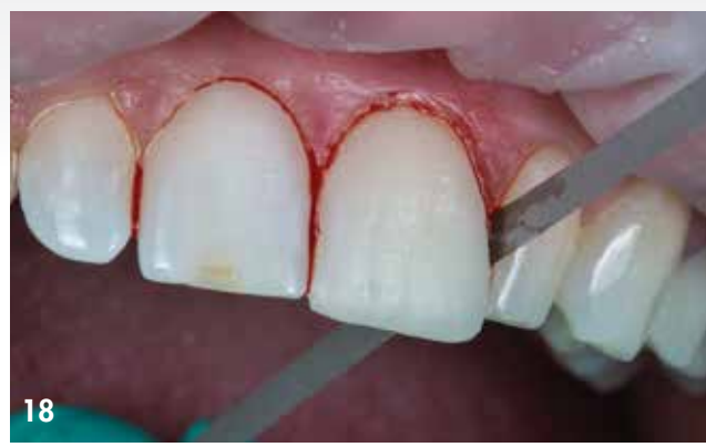
Figure 18: Interproximally, the margins were finished with metal strips.