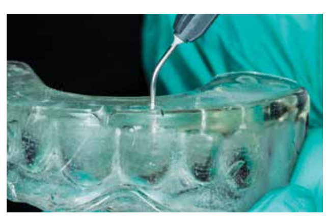
Figure 9: It was checked whether the holes were large enough to enable the tip of the composite syringe to pass easily and completely.