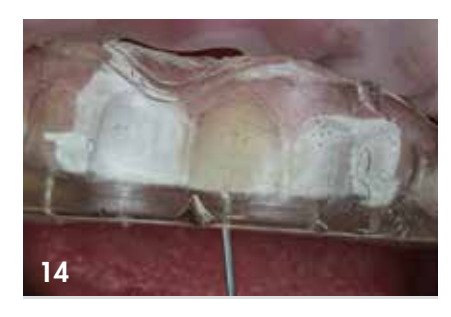
Figure 14: G-ænial Universal Injectable (GC) was injected into the silicone key.

gingiva to heal faster but also maintain the gingival health over time. The same procedure was repeated on the other incisors and the canines (Fig. 19-20).