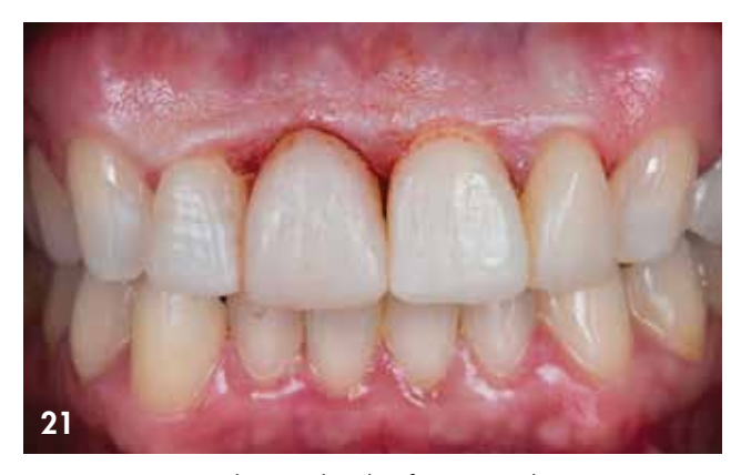
Figure 21-22: Result immediately after curing the composite.