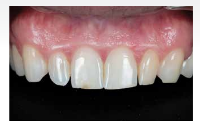
Figure 1-2: Initial situation.

(Fig. 6-7). Care was taken not to press too hard, so that all incisal edges were covered with a sufficiently thick layer in order to avoid potential tearing or deformation which could lead to a bad reproduction of the wax-up in the mouth of the patient. The tray was sufficiently filled to cover all teeth, up to the second premolars.