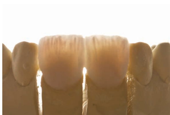
Fig 9 Reconstruction of the mamelons