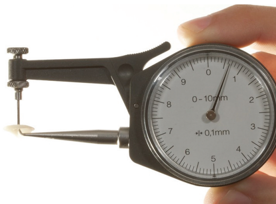
Fig 5 The pressed veneers are approx. 0.6 mm thick.

Conservative tooth preparation was carried out on both the labial and palatal side to place 360° veneers (Fig 2). After an impression had been taken and a model created, the frameworks were designed in wax featuring a thickness of 0.4 to 0.5 mm (Fig 3) and pressed with the IPS e.max Press Impulse ingots in Value 1 (Fig 4 and 5). The press temperature of the ingots corresponds to that of the HT ingots. The reaction layer is almost entirely removed when