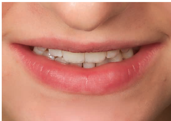
Fig 17 The result: harmonious contours of the lips ...