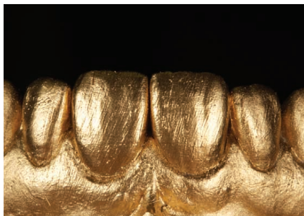
Fig 13 Gold powder facilitates the final contouring and shaping of the restorations.