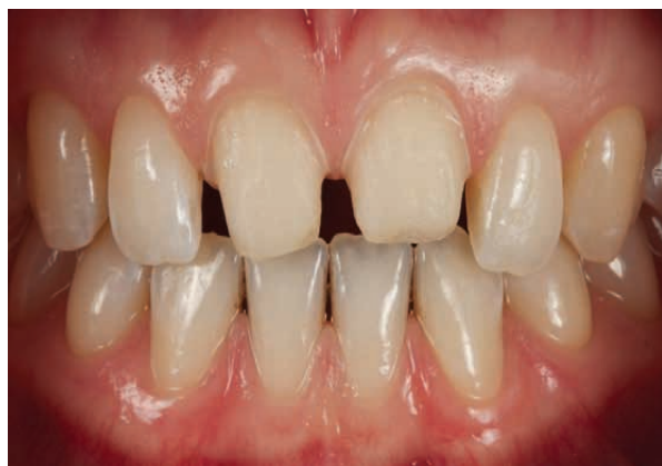
Fig 2 Conservative preparation design for 360° veneers

preparations and prevents the natural colour of the remaining tooth structure to shine through the restoration. Even the excellent light optical properties of the IPS e.max Press® HT (High Translucency) press ingots were not suitable for this patient case.