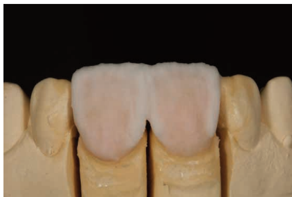
Fig 8 The youthful opalescent properties of the natural teeth can be mimicked in the proximal and incisal areas with Effect materials.