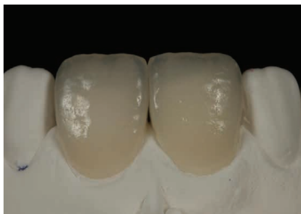
Fig 11 Layered veneers on the model