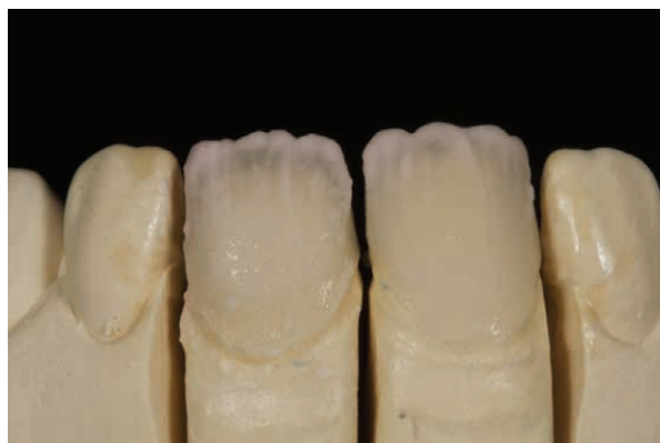
Fig 7 First, IPS e.max Ceram Dentin and Transpa Neutral were applied.