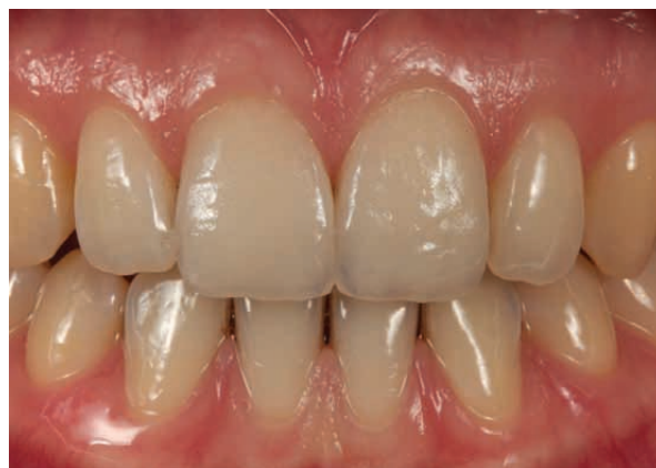
Fig 12 Try-in in the patient's mouth