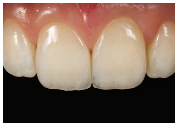
Fig 18 ... veneers with lifelike opalescent and ideal brightness effects and ...

restorations should be protected from light after application of the bonding agent (Heliobond® in this case). To prevent the conditioned surfaces from becoming contaminated, they should be etched and silanated not in the dental laboratory but immediately before they are placed in the oral cavity in the dental practice.