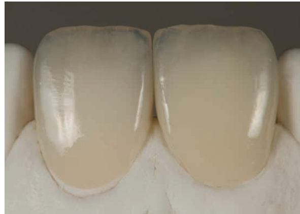
Fig 14 Completed veneers on the model

structures and the body was achieved with Dentin/OE3 and the brightness value was adjusted. Various Enamel and Opal materials were used to complete the tooth shape on the labial side.