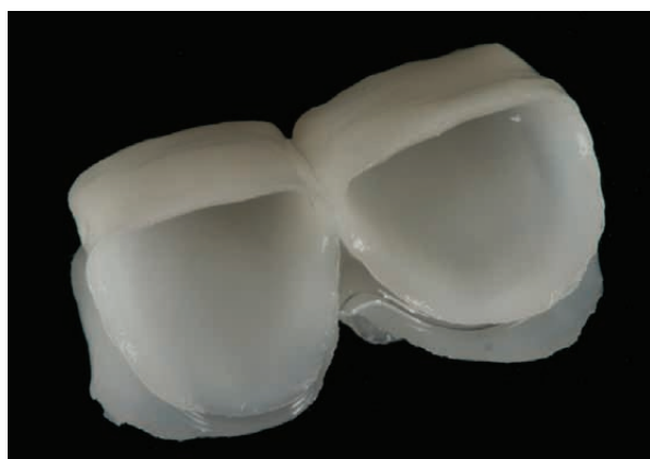
Fig 4 Copings after pressing of the ingots

I decided to use an individual layering technique for this patient case. The new Value ingots appeared to be the perfect material for this purpose. The translucency of these ingots is between that of the IPS e.max Press HT and the IPS e.max Press LT ingots.