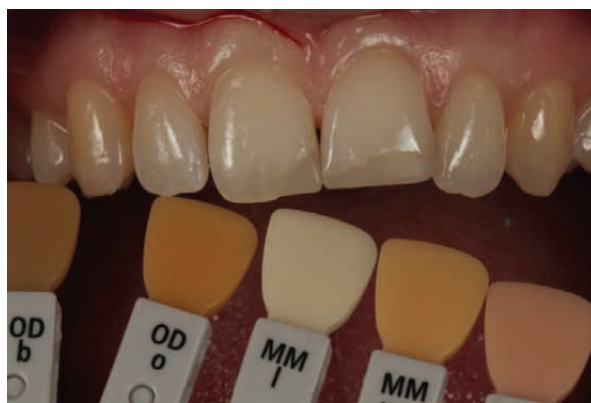
Fig 10 The mamelons were built up using a mixture of Effect materials which were defined beforehand.

the restoration is divested using glass beads (50 µm) at 2 bar pressure. In my opinion, using an appropriate furnace has a major effect on the outcome – for instance, the Programat® EP 5000 ensures gentle treatment of the material during the press cycle (Fig 6).