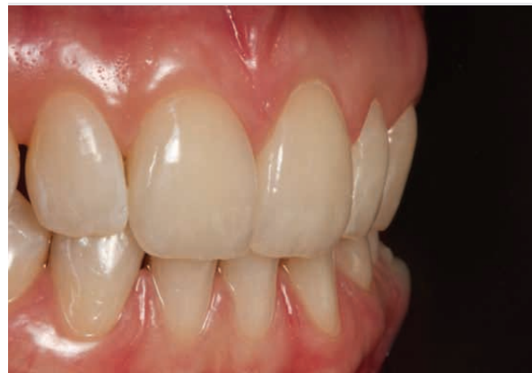
Fig 15 and 16 The restorations in situ optimally blend into the natural dentition