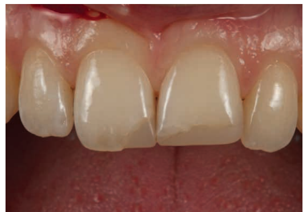
Fig 1 Initial situation: horizontal fracture with enamel splitting

Normally, I select an ingot that is one colour tone lighter than the actual tooth shade. This was not possible here. The Bleach BL ingots of the IPS e.max ® Press LT (Low Translucency) range did not match the requirements of this case. In addition, the saturation of the Bleach ingot is too high to be suitable for veneers on non-discoloured tooth