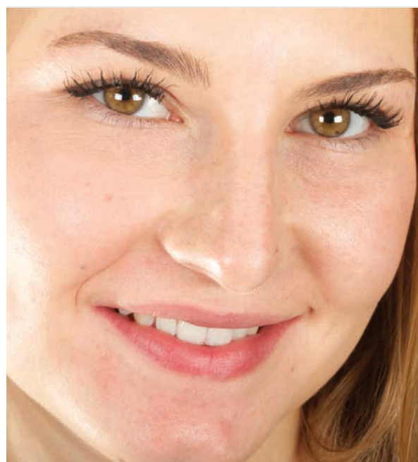
Fig 19 ... ultimately a happy patient.

Dental floss was used to remove surplus material from the interdental spaces, a brush for the margins and a small foam sponge for the palatal areas. Next, the veneers were polymerized to the tooth structure from the palatal and vestibular side for five seconds each side.