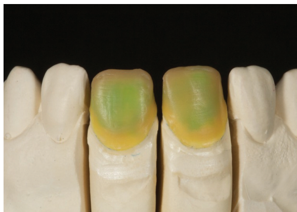
Fig 3 The IPS e.max Press Impulse copings modelled in wax

In addition, they offer a natural fluorescence. The chroma gradation is divided into three degrees (V1, V2, V3).