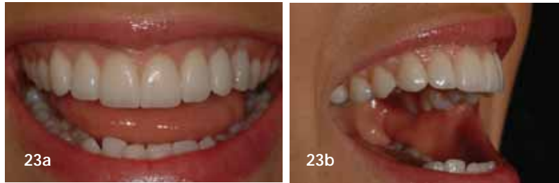
Figures 23a and b: The smile from different angles.

are not aligned properly into the dental arch (the teeth may have rotations or may be placed lingually or buccally), how can the final success of that case be assessed and the teeth prepared precisely and predictably every time?