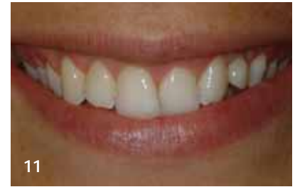
Figure 9: The incisal edges are aligned with a composite mock-up and the incisal edge position is defined. Then a reverse mock-up is applied over the soft tissues in order to determine where the soft tissues should be after the perio operation. Meanwhile the length to width ratio of the teeth are carefully worked out. Figure 10: After perio surgery, a new mock-up is produced in order to gauge the new proportions and relations among the teeth more successfully. Figure 11: Teeth are bleached after crown lengthening. Note the altered gingival margins.