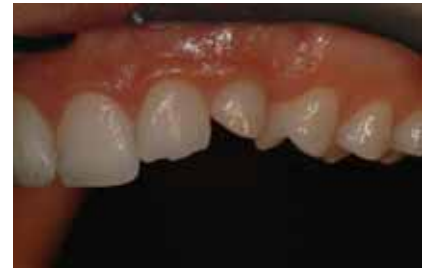
Figure 8: From this view the AOP can easily be evaluated. The deciduous canines display a distinct concavity.

recreation of a new smile involving the entire dentition. The mouth and its physiological make-up for each individual patient must be studied carefully by the aesthetic dentist, who should analyse and anticipate any problems that may arise during the treatment.