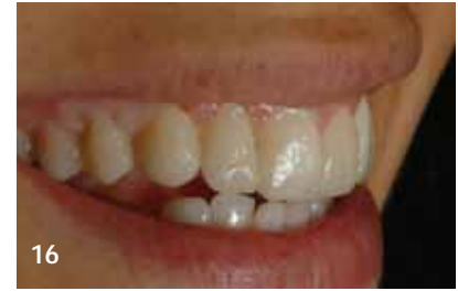
Figures 15a and b: An impression taken of the wax-up is filled with a flowable composite (or any material of choice) and placed on the unprepared teeth Figure 16: Completed smile design, before any tooth preparation is carried out (APT). This should now mimic the exact final contours, texture and shape of the final PLVs

preparation, the dentist should be provided with a silicone index (made from the wax-up model) that will indicate the final contours of the teeth. The index is then placed over the dental arch in order to visualise the existing positions of those teeth on the dental arch, relative to the final outcome of the wax-up and veneers (Figure 13). It may be possible to detect one problem at this stage: one or few teeth may touch or push the silicone index buccally, indicating that these teeth are either rotated or positioned more labially than the expected final outcome. Those teeth must then be trimmed down in order to place the silicone index passively on the dental arch in a process called APR (aesthetic pre-recontouring) (Gurel G, 2003a) (Figure 14).