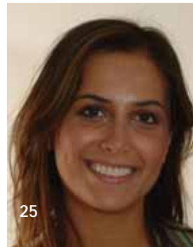
Figures 24 and 25: Full face before and after.

into an adhesive liquid. The interproximal contacts can then be cleansed using dental floss between the veneers. Once everything is completed, the luting resin can be fully polymerised.