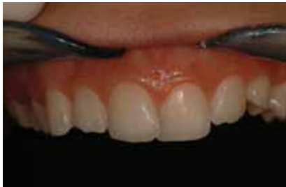
Figure 6: The unaesthetic appearance of the smile, which is relatively dark in colour, has short crowns, uneven gingival levels, crowded incisors, an uneven incisal silhouette and a deciduous canine on the second quadrant.