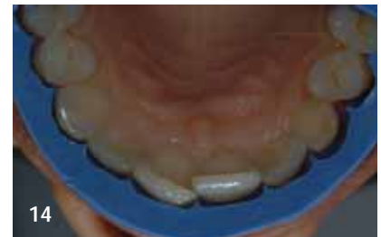
Figure 12: The final wax-up. Figure 13: A silicone index (SI) according to this wax-up is built to be used during the preparation stage. This SI is tried on the teeth. Note that SI can not be seated on the arch passively, due to the protruded position of the mesio-incisal corner of tooth 1. Figure 14: In such situations, APR (aesthetic pre-recontouring) is carried out. The protruding surfaces of teeth that are positioned labially – relative to the final contours of the finished PLVs – are trimmed down until the silicone index can be passively seated on the dental arch. Note the trimmed mesio-incisal edge of tooth 1 and how passively the index is seated on the arch after the APR. In order to test the final outcome of the proposed smile design, the APTs (aesthetic pre-evaluative temporaries) have to be tested.