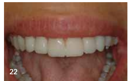
Figure 20: The deciduous canine \lfloor c and the premolar \lfloor 4 are prepped to receive crowns connected to each other in order to support the functional loads, especially during the excursions. Note the 360° chamfer all around the gingival margin. Figure 21: The final check for preparation depth of the veneers as well as the crowns with the SI. Figure 22: Provisional temporarily bonded in the mouth, replicating the final result exactly.