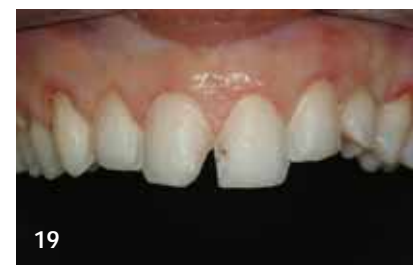
Figure 17: Since the APT resembles the exact facial contours of the proposed smile design, now the tooth operation can be done through the APT. This will give the dentist and the ceramist the exact volume of reduction, hence being minimally invasive. Figure 18: Incisal reduction finished through the APT Figure 19: The final preparation. Note how the mesio-incisal corner of the tooth 11 had to be reduced more than all the other teeth due to its protrusive position. Hence all the other teeth are minimally prepped with almost all the enamel left intact on their surfaces