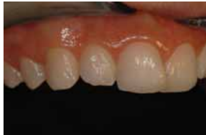
Figure 7: Analysing the smile at an angle shows the crowding of the centrals.