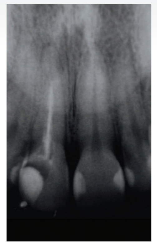
Figure 2: - Radiographic evaluation revealed an inadequate endodontic treatment with an alteration in the periapical area.

The advantage of this technique is that it allows a better understanding of the depth, details, characteristics, and transparencies of the dental structure. Additionally, the characteristics of the underlying dentine can be evaluated. In other words, this technique enables easier and straightforward appreciation of colour.