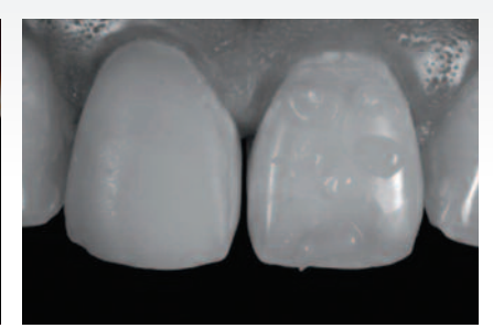
Figure 7: Greyscale photography used for evaluation of value of the resin composites to be used in the stratincation.