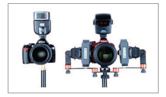
Figure 4: Different setups for obtaining cross-polarised photography. Left: a single flash with a polarised niter on the camera. Right: a twin flash using two polarising niters. Both options always had a polarised niter adapted in front of the lens

endodontic treatment. No sensitivities to percussion were detected horizontally or vertically. However, radiographic evaluation revealed inadequate endodontic treatment with an alteration in the periapical area (Figure 2).