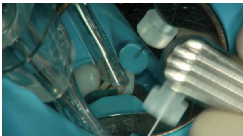
Figure 3: Apical negative-pressure irrigation system used to enhance debridement.

As the irrigant must be in direct contact with the microorganisms and canal walls to be effective, the accessibility of the irrigant to the whole root canal system, in particular in the apical third, is essential. In order to deliver the irrigant into the root canal for the entire length and to obtain a good flow