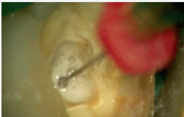
Figure 1: Ultrasonic activation with a passive file

Ultrasound creates bubbles of positive and negative pressure in the molecules of the liquid with which it comes into contact. The bubbles become unstable, collapse and cause an implosion similar to a vacuum decompression. Exploding and imploding they release impact energy that is responsible for the detergent effect. It has been demonstrated that ultrasonic activation of NaOCl dramatically enhances its effectiveness in cleaning the root canal space, as ultrasonic activation greatly increases the flow of liquid and improves both the solvent and antibacterial capacities and the removal effect of organic and inorganic debris from the root canal walls. 7