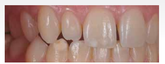
Figure 3: Occlusal check: incisal edge must be reduced during preparation to allow sufficient thickness for incisal ceramic (1,5 mm).