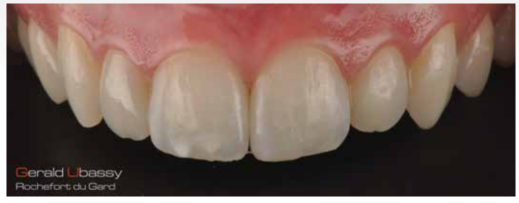
Figure 20: Final (ceramist Gerald Ubassy).