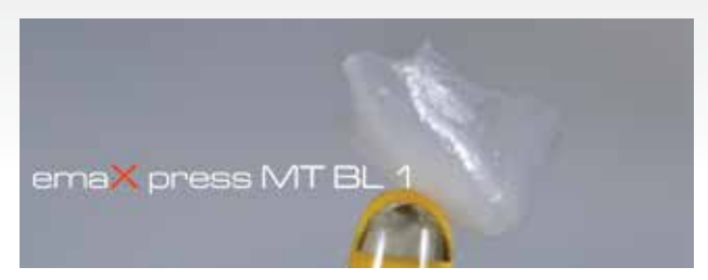
Figure 10: No prep restorations are made with emaX press and then polished. No stain is required.