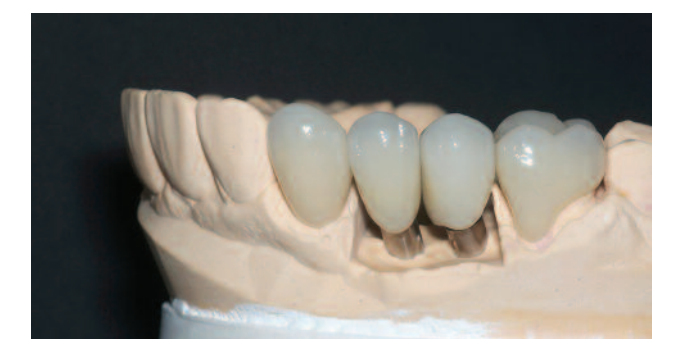
Figure 22a: Restoration of Ankylos implants with Atlantis abutments and E.max crowns.