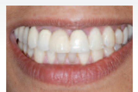
Figure 1: Pre-treatment, smile view.